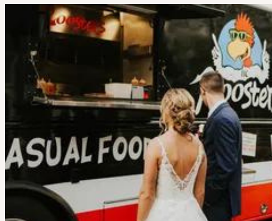
FOOD TRUCK VIBE