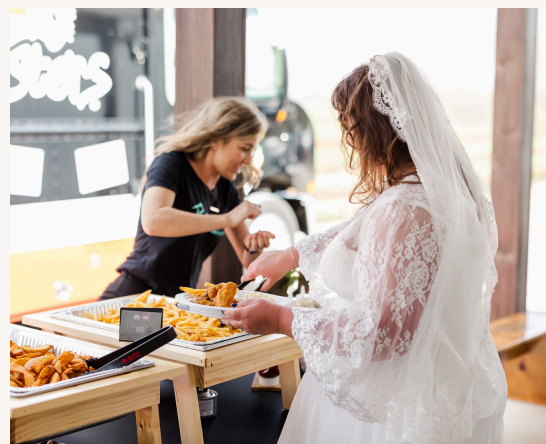
FOOD TRUCK CATERING