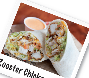
Rooster Chicken Wrap

Grilled or fried tenders rolled up in a fresh wrap with shredded lettuce, tomatoes and a blend of cheese. Served with Roosters Spicy Ranch or your choice of dressing on the side. - 8.99 *870-970