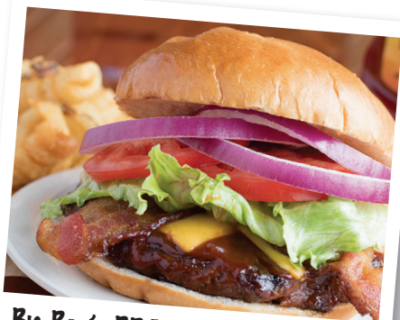
Big Bob's BBQ BURGER WITH CHEESE

This chicken breast took a bath in our homemade marinade before we tossed it on the grill. It's one of our favorites! - 6.99 *470